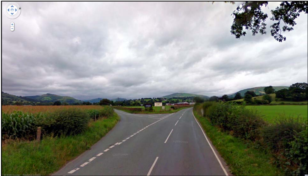
Turning at fork for B4396

Bear left at the fork and continue for about 300 yards ( B4396 ) to the crossroads - at the crossroads (cemetery on the right-hand side), turn left ( B4580 ) for Llanfyllin – go over the little bridge and up the hill through Rhos y Brithdir .